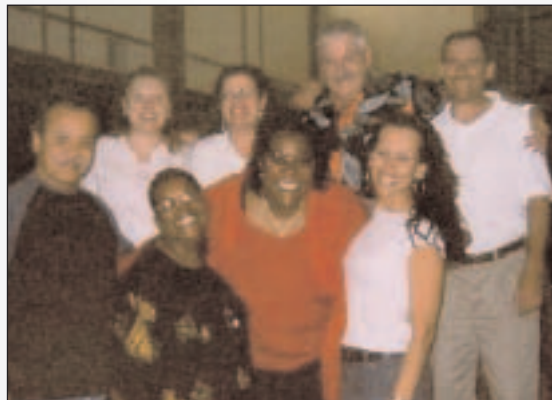
Members of the California Parent Leadership Team

Due to the dynamic partnership between the California Department of Social Services, Office of Child Abuse Prevention (CDSS/OCAP), Parents Anonymous® Inc. and the California Parent Leadership Team (CPLT), many California counties are finding new and exciting opportunities to work in Shared Leadership and more effectively accomplish our goals of preventing child abuse and neglect throughout the state. The CPLT is a key statewide organizational unit composed of diverse Parent